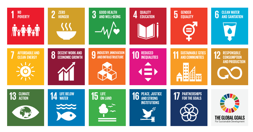
Fig. 2: Sustainable Development Goals (SDGs)

goals of diaconal action and their dedication to work for justice, peace and the integrity of creation.