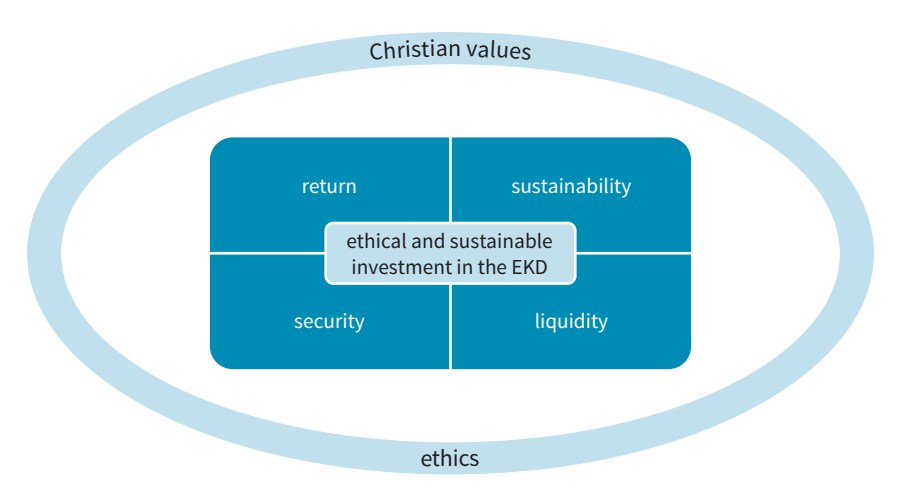
Fig. 3: Ethically-Sustainable Investment – Definition and Objectives

If these goals are observed, the conditions of an ethically-sustainable investment are fulfilled in accordance with the essence of these Guidelines.